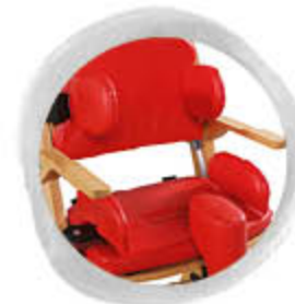
thoracic supports, pelvic supports, abduction wedge