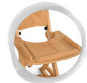
attachable therapy table