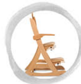
seat and foot plate angle adjustment