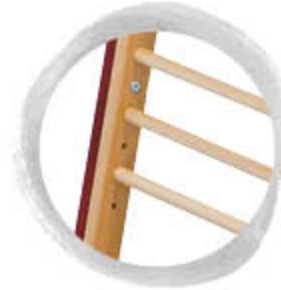
Height adjustable hand grip