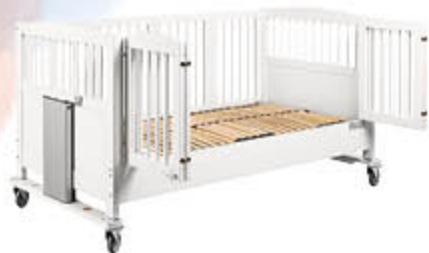
ID: 32973 white lacquered