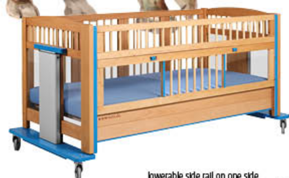
lowerable side rail on one side with 24 cm push-on element (standard)