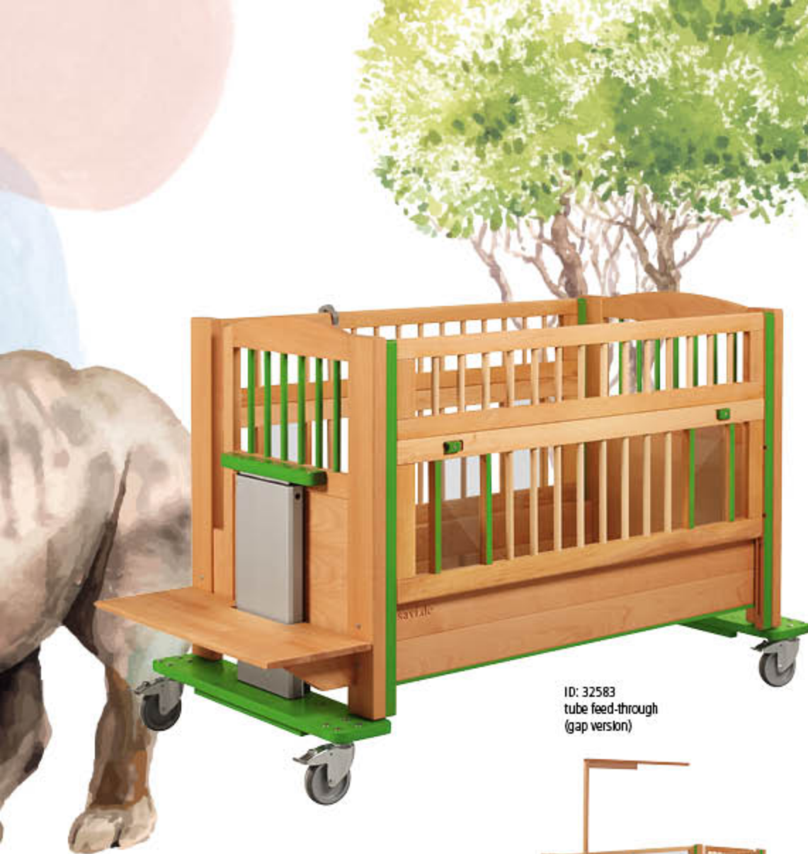
ID: 32583 tube feed-through (gap version)