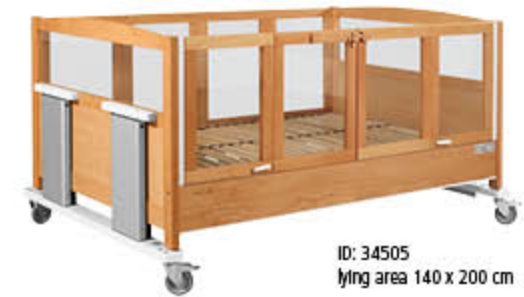
ID: 34505 lying area 140 x 200 cm