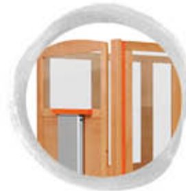
tube feed-through (gap version)