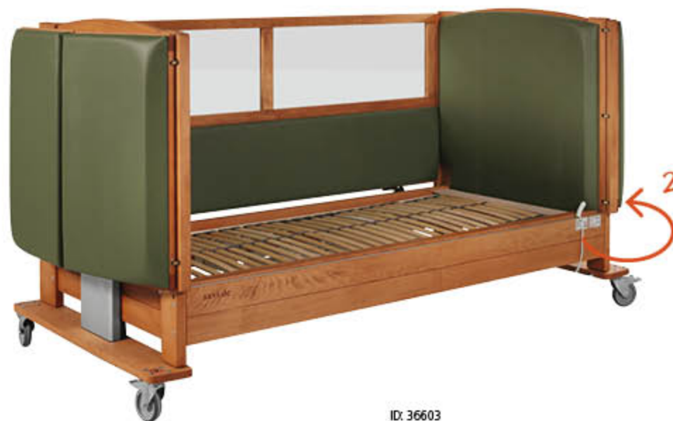
ID: 36603 wood colour 'Teak'