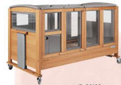
ID: 36496 supply opening (hole) with closing mechanism