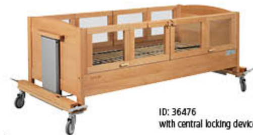
ID: 36476 with central locking device