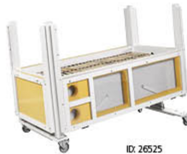
ID: 26525 With Trendelenburg-function, supply opening (hole)