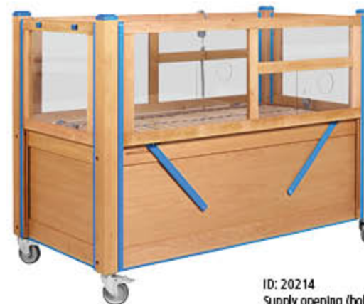
ID: 20214 Supply opening (hole) with closing mechanism