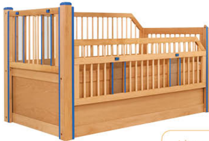
ID: 10394 Adaption of the bed for sloping ceiling