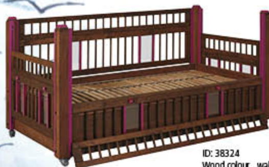
ID: 38324 Wood colour „walnut”