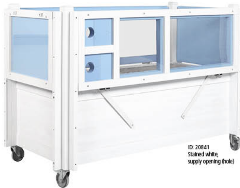
ID: 20841 Stained white, supply opening (hole)