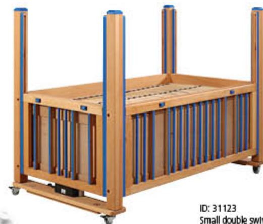
ID: 31123 Small double swivel castors, blue sticks