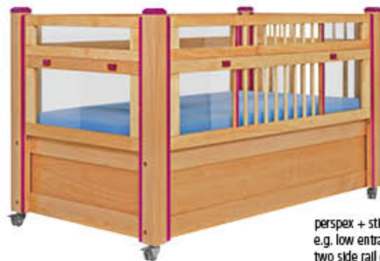
perspex + sticks, e.g. low entrance (47 - 87 cm) and two side rail elements (40 cm + 20 cm push-on element)