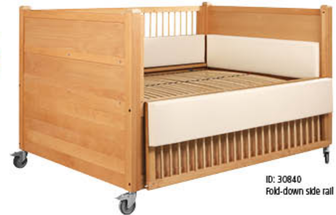
ID: 30840 Fold-down side rail