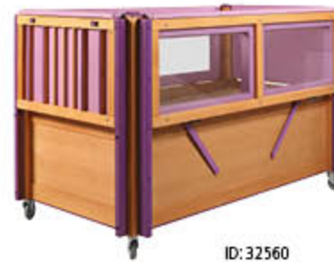
ID: 32560 With edge padding