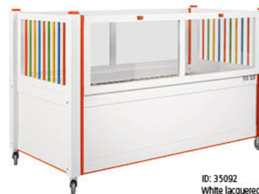
ID: 35092 White lacquered