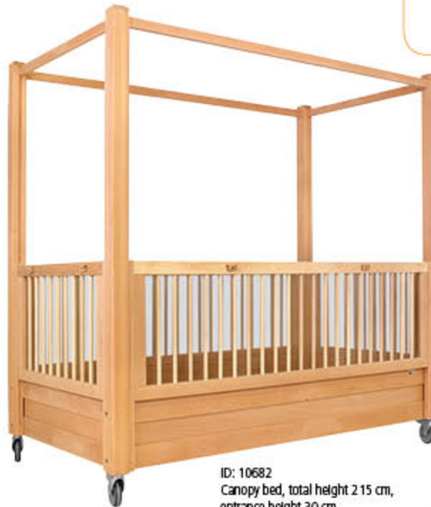
ID: 10682 Canopy bed, total height 215 cm, entrance height 30 cm