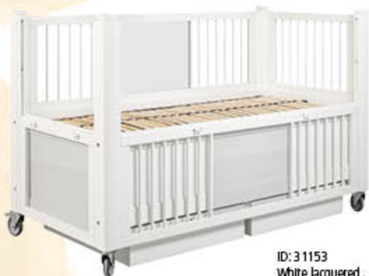
ID: 31153 White lacquered, two drawers, partly Lexan, partly sticks