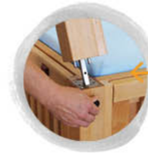
Removable corner posts