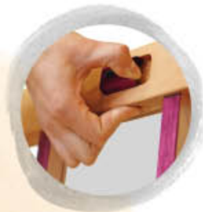
recessed safety grip (basic)