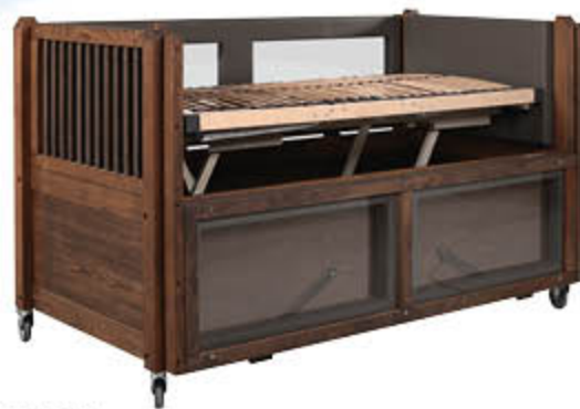
ID: 35165 Wood colour „Barrique“, electric lowerable side rail

„I love a good place to sleep and lounge.“