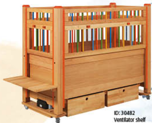
ID: 30482 Ventilator shelf