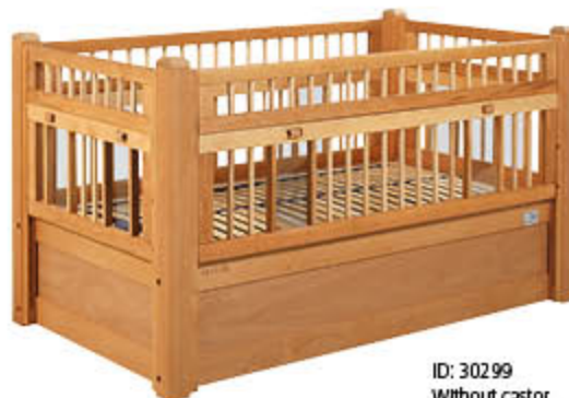
ID: 30299 Without castor