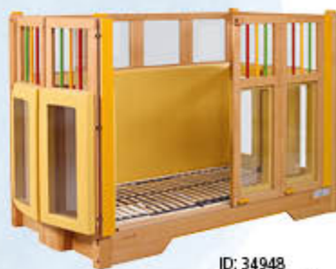
ID: 34948 Without castors, coloured sticks