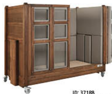
ID: 37188 Step protection for the slatted frame