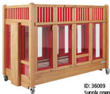
ID: 36009 Supply opening (hole) with closing mechanism

The windows offer an optimal view. So you keep an eye on your child easily and your child feels visibly more comfortable.