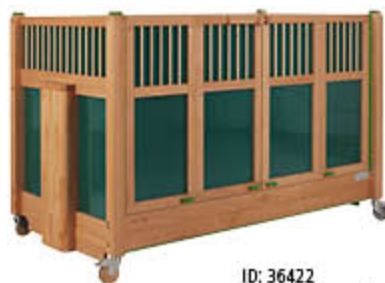
ID: 36422 Child's name on the side of the bed