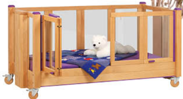
Barred side height 72 cm, e.g. In blue-purple colour accent with wooden castors

A lot of safety, even for particularly active children