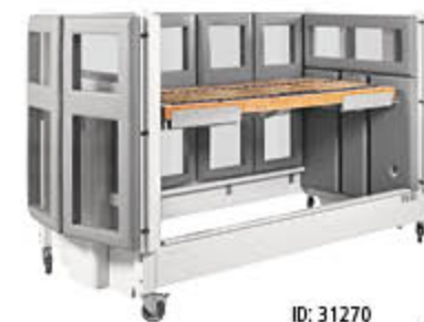
ID: 31270 White lacquered (opaque)