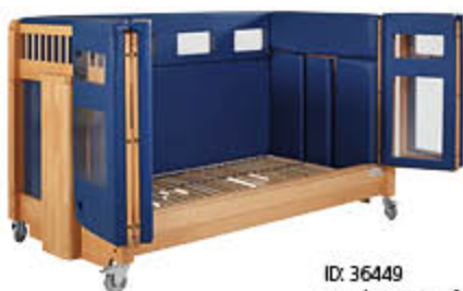
ID: 36449 Supply opening (hole) with closing mechanism