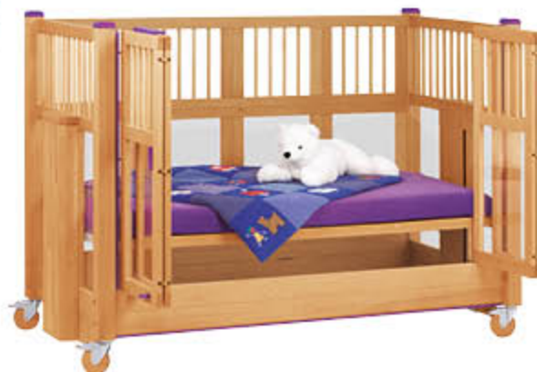
Barred side height 113 cm, e.g. In blue-purple colour accent with wooden castors