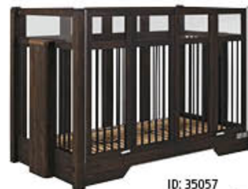
ID: 35057 Low entrance height (without castors)