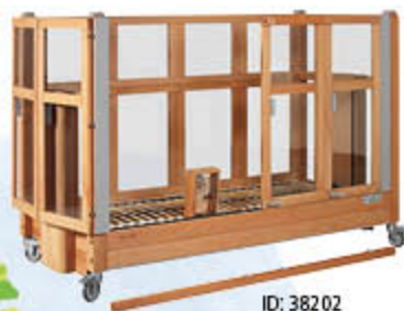
ID: 38202 Colour accent grey, lockable Handset-box, external lock