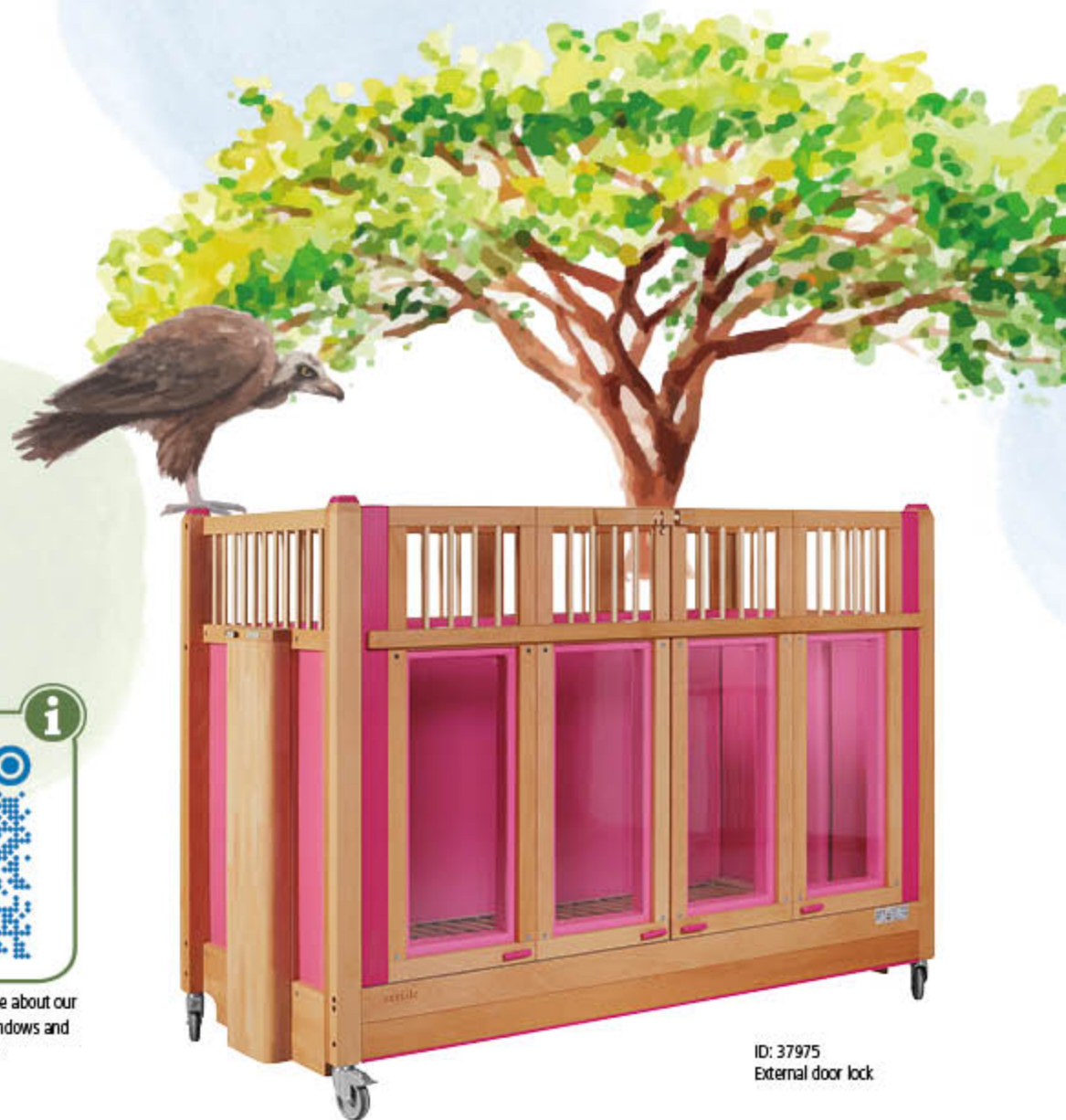
ID: 37975 External door lock

Scan the QR code to find out more about our fixed Skai-padding with vinyl windows and its padding capability.