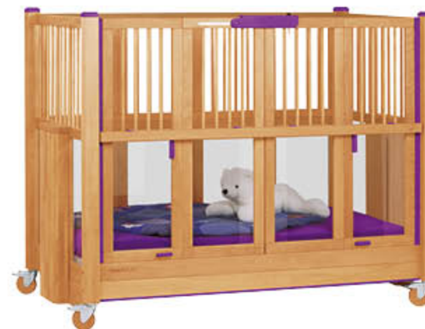
Barred side height 135 cm, e.g. In blue-purple colour accent with wooden castors